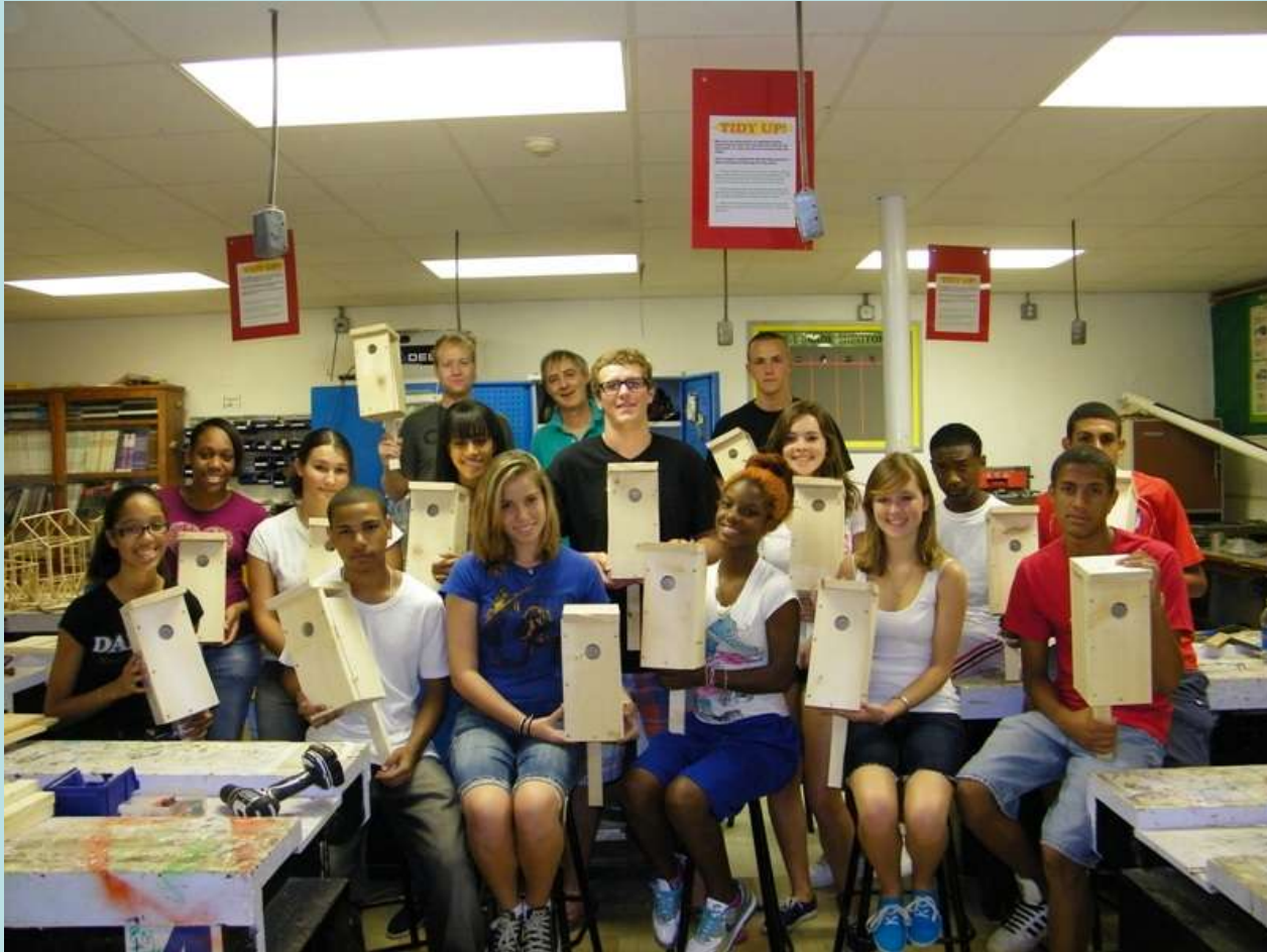
Warwick Academy students