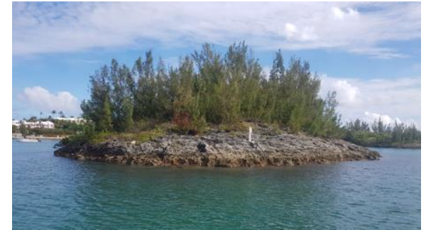
Above: Cat Island Below: Partridge Island