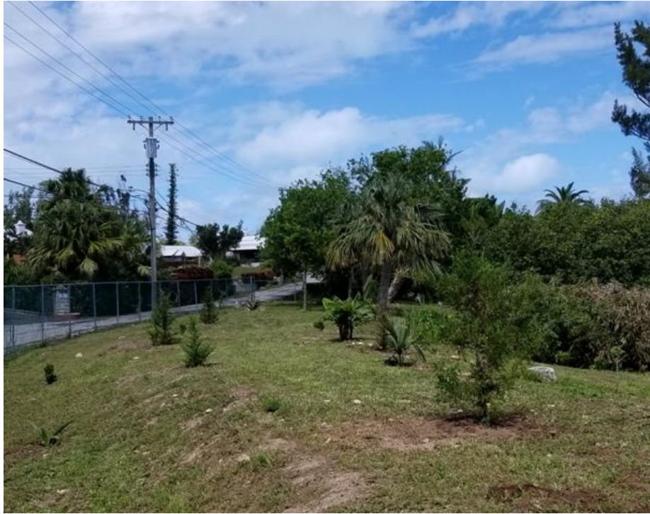
Above: New plantings of natives and endemics