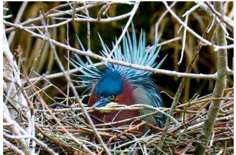
Green Heron on nest, photo by Daria Taiakina