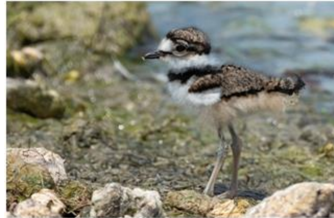
First recorded Killdeer nesting, at new airport pond, photo Tim White