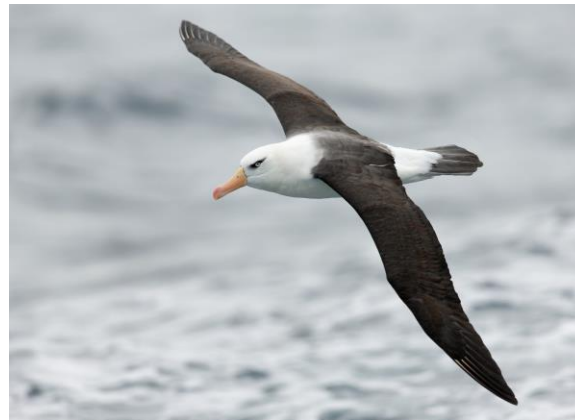
First record of Black-browed Albatross