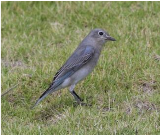
First record of Mountain Bluebird