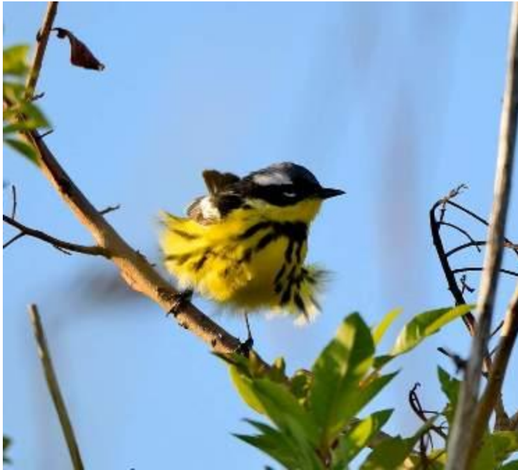
Magnolia Warbler