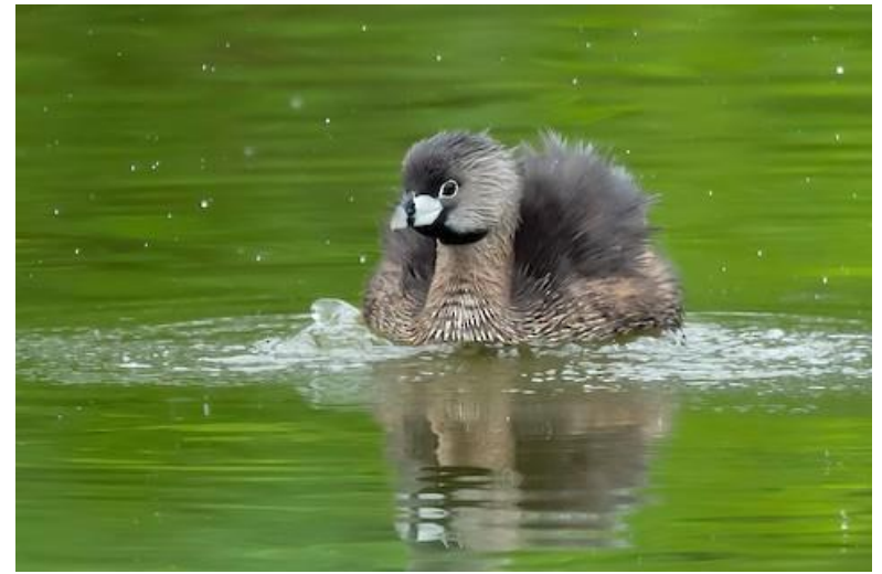
Young Pied-billed Grebe

Sign up to Audubon's Facebook and Instagram pages to enjoy our members' beautiful photography – and send in your own!