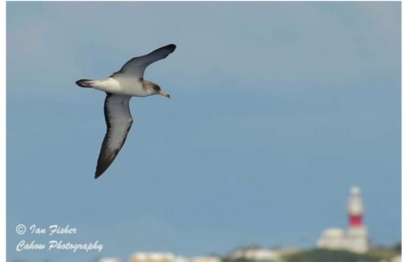
First record of Scopoli's Shearwater