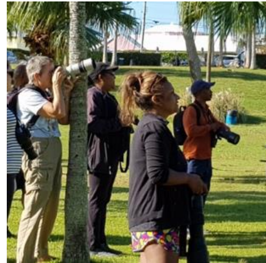
Bird Photography walk in Arboretum, February