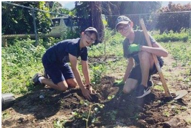
Volunteer tree planting November 2020