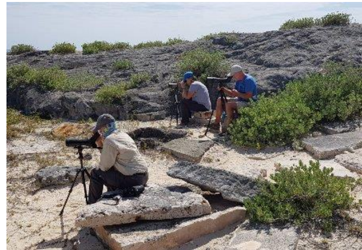
Seabird watch, Coopers Island