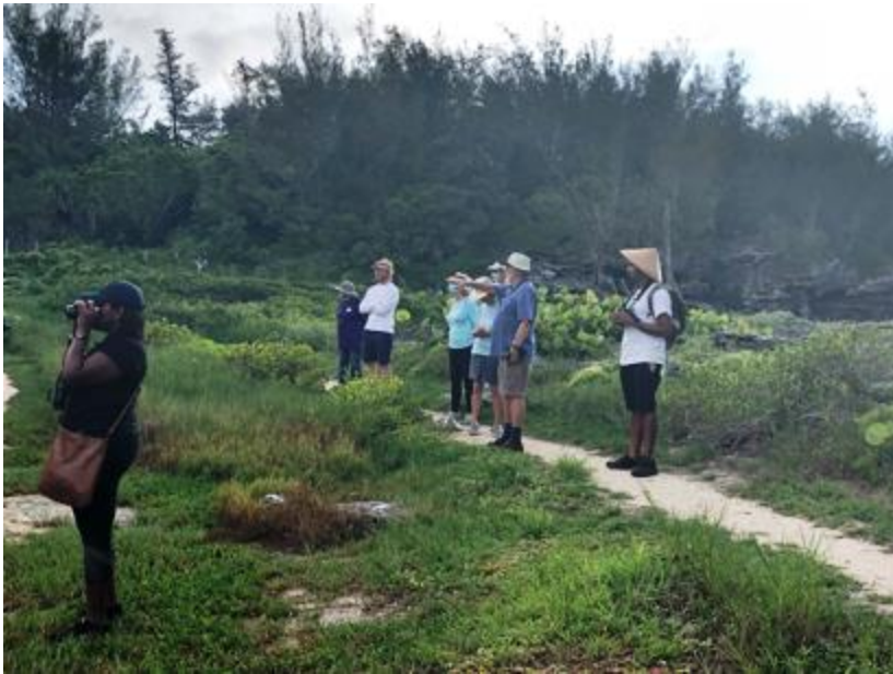
Spittal Pond Field Trip, World Shorebirds Day 6 September