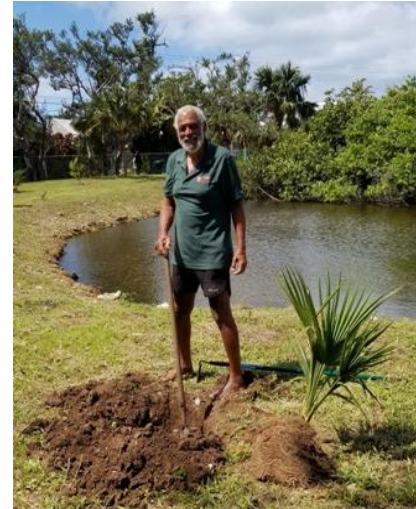
Volunteer tree planting May 2021