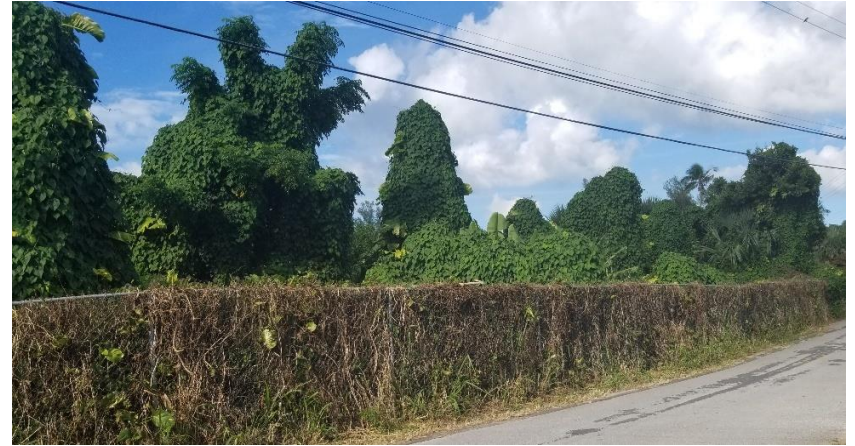
Above and below: Somerset Long Bay West Nature Reserve before restoration