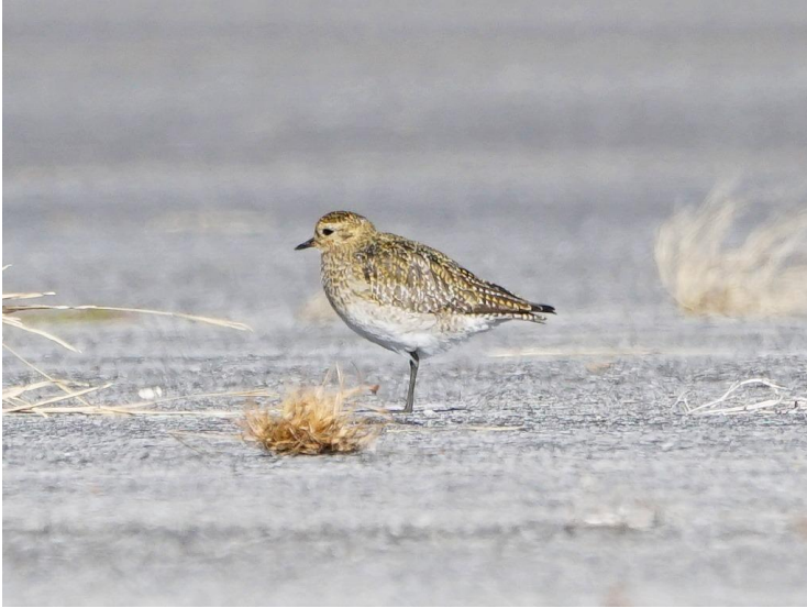
First record of European Golden-Plover