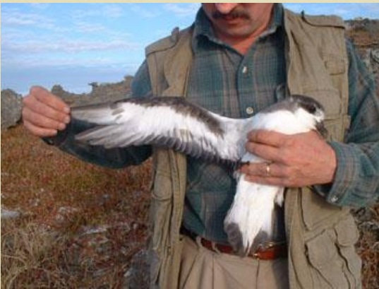
Bermuda's National Bird - the Cahow or Bermuda Petrel.