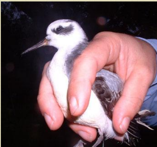
Red Phalarope