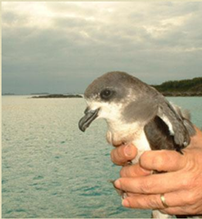
Adult Cahow.