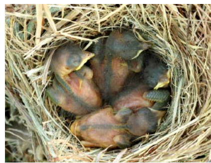
Chicks in nest