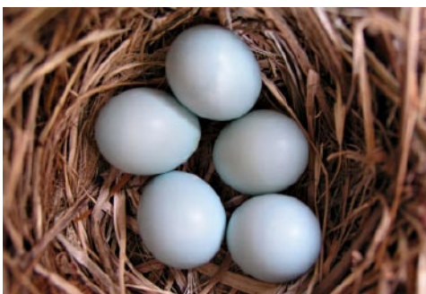
Bluebird eggs in a nest

A Bluebird trail is a series of Bluebird boxes placed along a prescribed route. In areas where nesting boxes have been put up in suitable habitat, Bluebird populations are increasing.