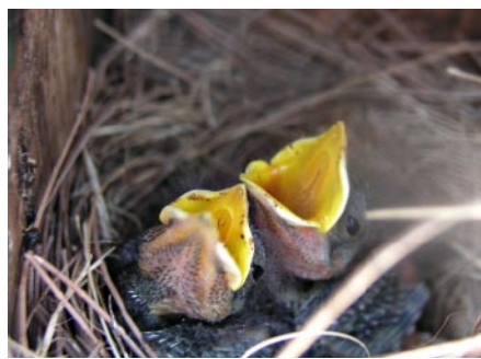
Hungry chicks await food